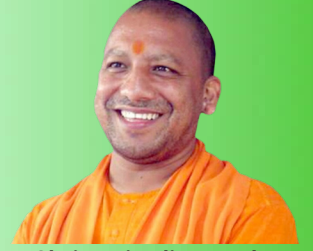
Shri Yogi Adityanath Hon'ble Chief Minister of Uttar Pradesh