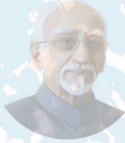
SHRI M. HAMID ANSARI Vice President of India & President IIPA 2007-2017