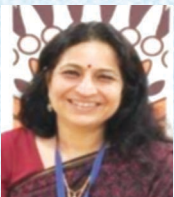
Professor of e-Governance and ICT