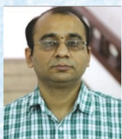
Assistant Professor of Operation Research