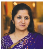
Assistant Professor in Public Administration