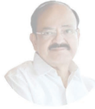
SHRI M VENKAIAH NAIDU Vice President of India & President IIPA