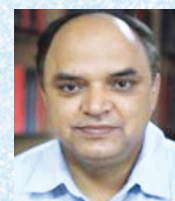
Assistant Professor of Urban Development