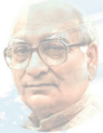
SHRI KRISHAN KANT Vice President of India & President IIPA 1997-2002