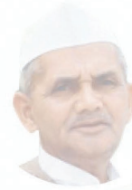
SHRI LAL BHADUR SHASTRI Prime Minister of India & President IIPA 1964-1966