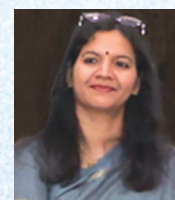
Assistant Professor of ICT & E-Governance