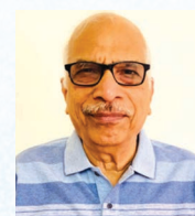
Professor of Urban Management