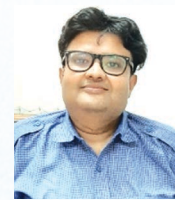
Assistant Professor of International Relations and International Administration