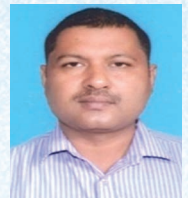
Associate Professor of Development Studies