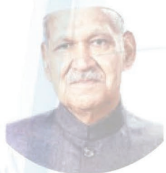
DR. S.D. SHARMA Vice President of India & President IIPA 1987-1992