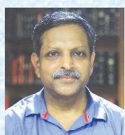
Programme Director Associate Professor in Public Administration