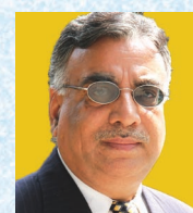
Professor of Public Administration