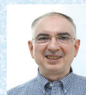
Professor of Applied Economics

Areas of Interest: Applied Economics, Agriculture Economics, Rural