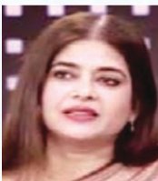
Chair Professor, Dr Ambedkar Chair for Social Justice