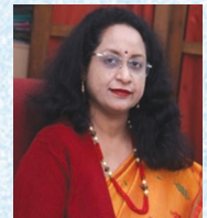
Associate Professor of Behavioral Science