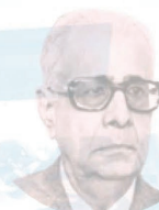
SHRI M. HIDAYTULLAH Vice President of India & President IIPA 1979-1984