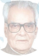
SHRI B. S. SHEKHAWAT Vice President of India & President IIPA 2002-2007