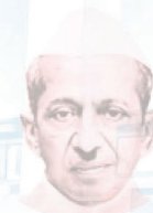
SHRI B.D. JATTI Vice President of India & President IIPA 1974-1979