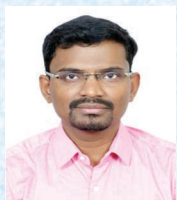
Assistant Professor of Sociology