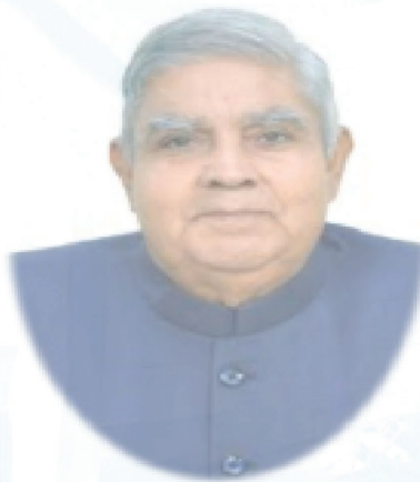
JAGDEEP DHANKAR Vice President of India President IIPA 2022 onwards