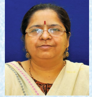
Associate Professor in Urban and Regional Planning