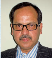
Professor in Urban Finance