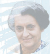
SMT. INDIRA GANDHI Prime Minister of India & President IIPA 1970-1972