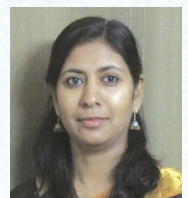
Associate Professor of Applied Statistics