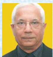
Sr. Professor of Disaster Management