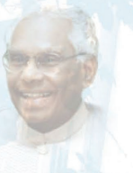
Dr. K.R. NARAYANAN Vice President of India & President IIPA 1992-1997