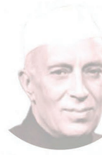
SHRI JAWAHARLAL NEHRU Prime Minister of India & President IIPA 1954-1964