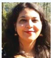
Assistant Professor of Environment Management & Climate Change