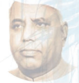
SHRI Y.B. CHAVAN Minister of Home Affairs, India & President IIPA 1967-1970