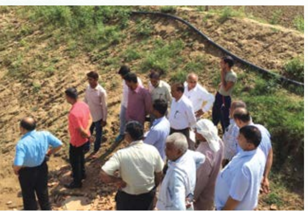
The Participant during field visit at Jal Shakti District, Alwar