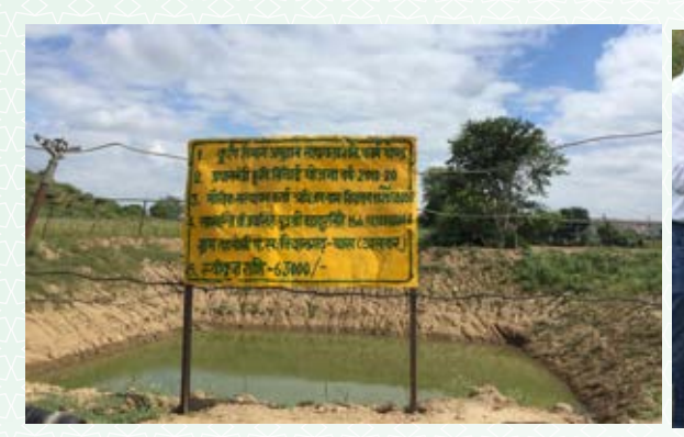
A picture during field visit in Alwar