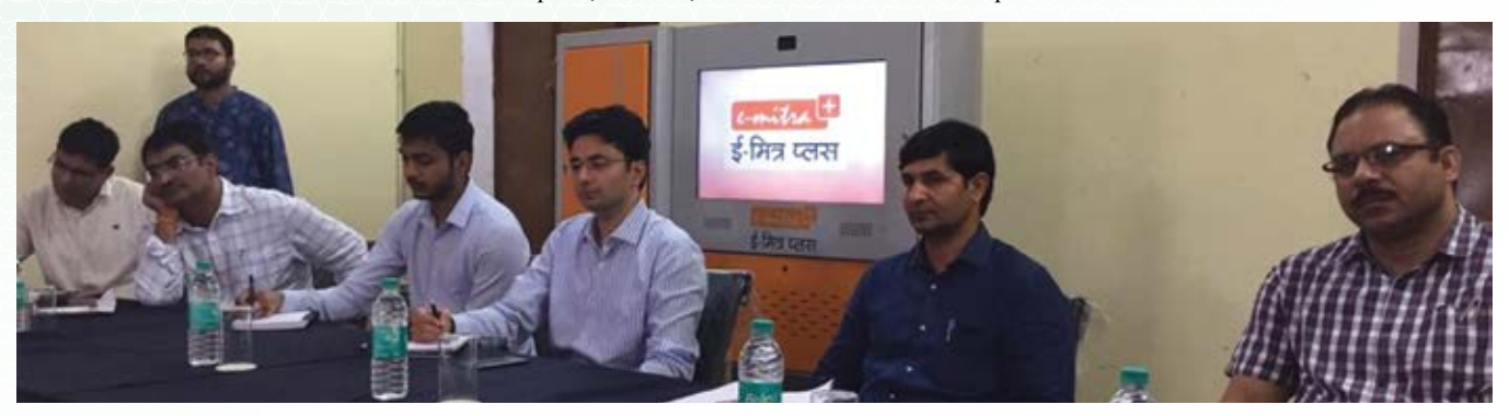
District Collector, Alwar welcoming the Group at Bambora Gram Panchayat