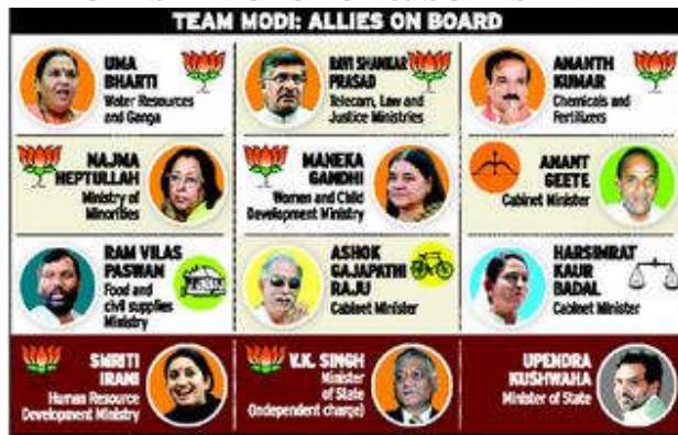
* Partial list of likely portfolios

Rewarding loyalty and promoting the younger generation, Prime Minister Narendra Modi also accommodated all Bharatiya Janata Party heavyweights of his generation and representatives of key pre-poll allies, avoiding major surprises in the council of ministers.